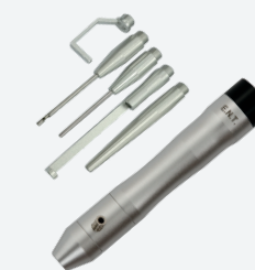
ENT HP & Tips