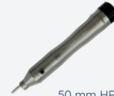
50 mm HP