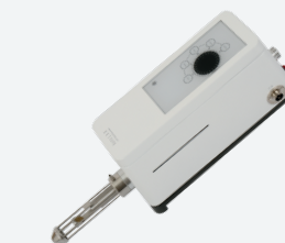
Automatic LVR HP