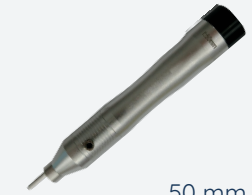
50 mm HP