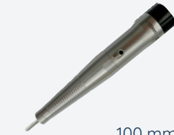
100 mm HP