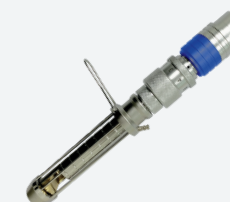
Manual LVR HP