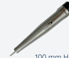
100 mm HP